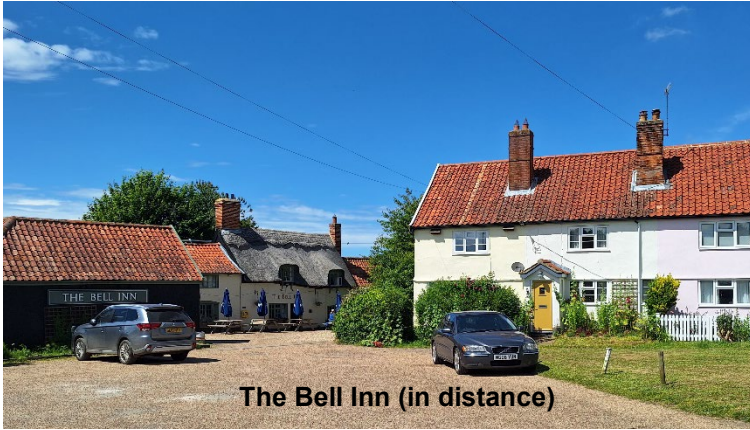
The Bell Inn (in distance)

The village pub, The Bell, tucked away in a corner off the village green, had reportedly been closed earlier in the year due to the