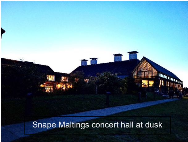
Snape Maltings concert hall at dusk

The one day on which we were booked for three concerts we first drove down to Orford for a concert in the church which included